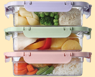
reusable to-go containers

Help your customers protect the environment and reduce litter. Encourage reusable options.