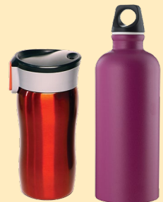
reusable coffee mugs and water bottles

Visit the WA Ecology website to learn about alternatives to expanded polystyrene products and regulations on how customers can safely use their own containers.